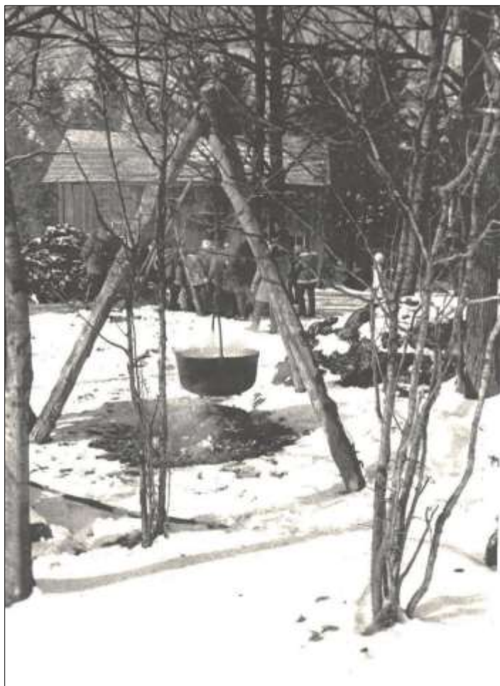
Above picture is from 1971 - Spring Maple Syrup demonstrations at the Niagara Peninsula Conservation Authority.