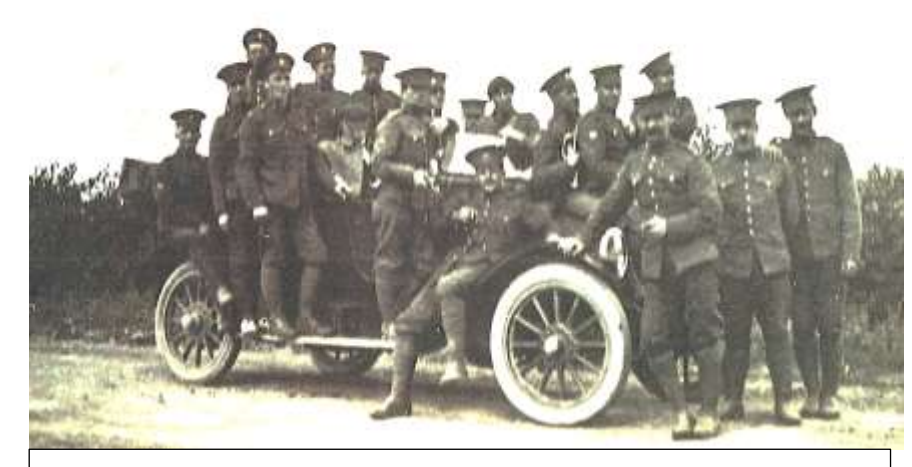
MILITARY SOLDIERS IN VINELAND 1915

Website: <a href="www.lincolnarchives.ca">www.lincolnarchives.ca</a> * Friends of Lincoln's History is also on Facebook * Email: lincolnarchives@gmail.com