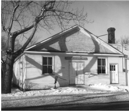
Campden Village Hall

It was first called Moyer's Hall, then it became Zimmermann Hall, followed by Fry's Hall and Albright Hall. In 1917 it became Campden Village Hall, and was sadly torn down in the spring of 2003.