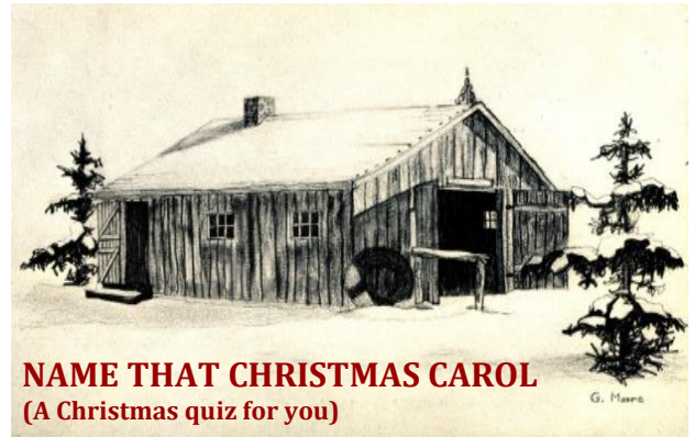
NAME THAT CHRISTMAS CAROL (A Christmas quiz for you)