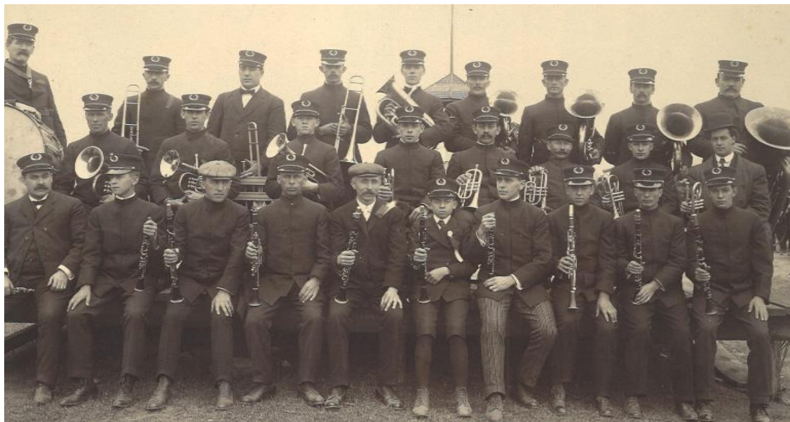
THE BEAMSVILLE BAND circ. 1908